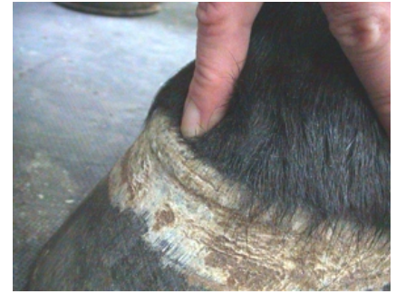
Figure 17. How to feel for the depression at the coronary band indicative of acute founder or sinker syndrome. Run the finger lightly down the pastern and over the coronary band onto the hoof wall. There is no resistance to this procedure in the normal animal: in a case of acute founder or sinker syndrome the finger tends to lodge in a depression as shown in the figure.

the hoof wall seems to merge with the skin. The white line of the foot becomes stretched or wider than normal around the toe of the foot. The sole of the foot may appear flat or dropped i.e. lower than the hoof wall at the ground surface. When the pedal bone moves down the coronary papillae may become permanently damaged leading to a reduced rate of growth compared with the unaffected part of the coronary corium at the heels. This can be seen easily if the animal has growth rings on the hoof walls. If a horse has foundered the rings will be wider at the heels than the toe. (It is important to differentiate between the growth rings of chronic founder and those of a change in diet. Chronic founder rings are divergent, i.e. wider at the heels than the toe whereas the rings caused by a change in feeding are the same width all the way round the foot.) When the two sets of laminae are pulled apart, the surface of the healing laminae may be altered leading to an abnormally high rate of production of laminar horn which grows straight forwards leading to the elongating toe and stretched white line. This alteration to the laminae is not always permanent. Flattening of the sole is due to the new, lower position of the pedal bone within the hoof. This flattening of the sole can be reversed in many cases by surgical treatment to the deep digital flexor tendon and heart bar shoeing.