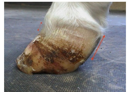
Figure 19. A foot showing the classical changes of chronic founder, high heels, concave front wall and divergent growth rings. Many of these types of case can be dramatically improved by correct foot trimming and shoeing.

From the foregoing, it is possible for you and your veterinary surgeon to tell the difference between a case of LAMINITIS, ACUTE FOUNDER, SINKING or CHRONIC FOUNDER just by looking at the feet. It is important that these different types of the basic condition are recognised as each carries a different prognosis and each can be expected to respond to treatments differently. Prognosis means the prediction of the outcome following treatment i.e. whether the animal will be cured or not. Treatment that consists of a balanced combination of medical, farriery and possibly surgical approaches has the best chance of success. The sooner correct treatment is started the better the chance of recovery. Prompt treatment is mandatory for the more severe forms, the acute founder and sinker cases. I will begin by describing the foot treatments that are recommended for each type of case.