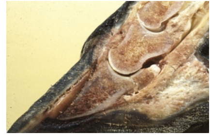
Figure 14. Split foot of a case of acute founder (compare with Fig. 25).

It seems that the basic problem in laminitis is an interruption to the normal blood flow to the laminar corium early in the development of laminitis ( possibly causing activation of matrix metalloproteinase enzymes which shed the epidermal cells from the basement membrane). Areas of laminar corium are deprived of their normal blood supply by two mechanisms a) the arteries and veins clamp down constricting the diameter of the blood vessels; and b) blood is shunted away from the tissues of the laminar corium directly into the veins. This shunting occurs via specialised vessels called arteriovenous anastomoses opening and allowing blood from the high pressure arterial side of the circulation to flow directly into the veins without flowing through the laminar corium. This loss of normal blood supply is known as ischaemia (iskeemear). We know that it takes about four minutes for areas of the human brain to be irreparably damaged by lack of blood supply when a person has a stroke; this is the same type of damage which occurs in the laminae of a horse's foot during the early stages of laminitis. The severity of damage to the laminar corium is determined by a) the time during which ischaemia persists, and b) the area of the laminar corium which is affected.