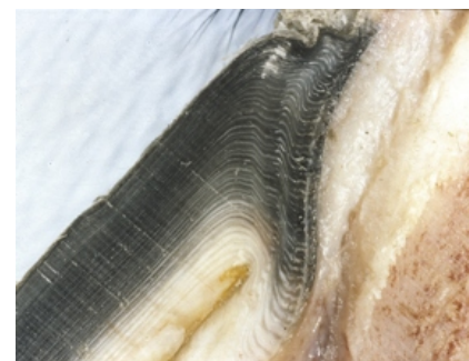
Figure 16. View of the coronary papillae in the midline from a case of acute founder. Notice how the papillae and the juvenile horn tubules have become bent by the downward movement of the pedal bone. Compare to the normal situation in Figure 7.

If the founder worsens and the pedal bone keeps descending, the horny sole becomes flattened or even convex. Thus in the acutely foundered horse, in addition to the reduction in blood supply due to laminitis, the situation is worse because the descending pedal bone has physically distorted the blood vessels. The circumflex artery of the distal phalanx and the vessels of the solar corium have become trapped between the pedal bone and the horny sole (Fig. 15). In severe cases the bone may push right through the horny sole; this is known as solar prolapse (Fig. 56). It can be appreciated that the further the pedal bone moves down, the worse the degree of founder. It is possible to tell whether a horse is foundered by feeling around his coronary bands. In the normal horse, if you run your finger down the front of the pastern, over the coronary band and onto the hoof wall, your finger slides easily. If the horse is foundered your finger tends to lodge in a ditch or depression just above the coronet. When the horse founders and the pedal bone moves down, it drags the tissues under the skin with it which creates the ditch you can feel with your finger (Fig. 15). The deeper the ditch and the farther it extends sideways around the coronet, the worse the founder (Fig. 17).